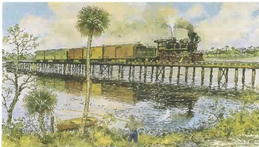
Train crossing a lake near Gainesville, ca. 1890s

Steamboat tours on Florida's winding rivers were a popular attraction for these visitors.